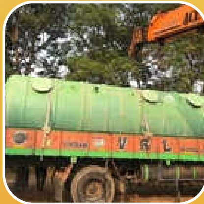
Industrial Sewage Treatment Plant