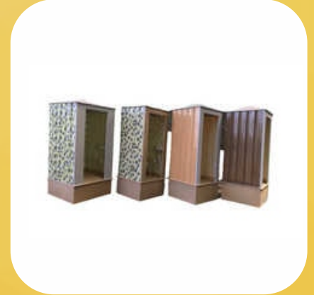
Prefab Modular Toilet Cabin