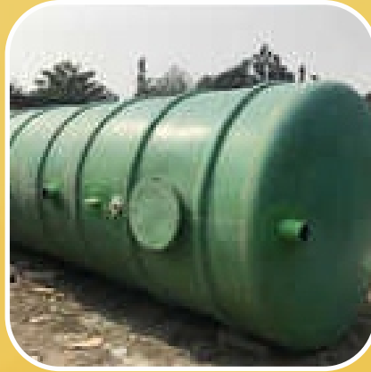
15 kld Sewage Treatment Plant