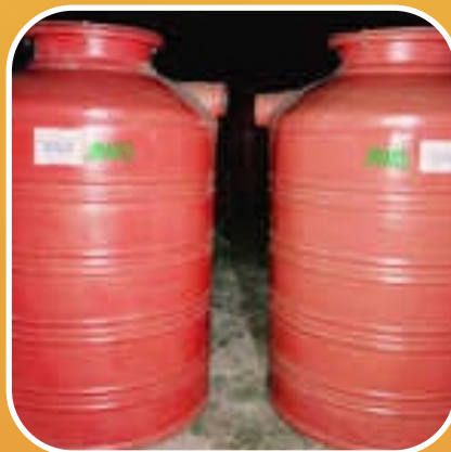
FRP Red Biodigester Tank