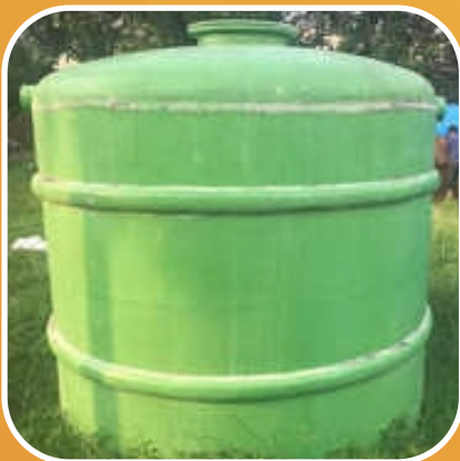
3000 L Biodigester Tank