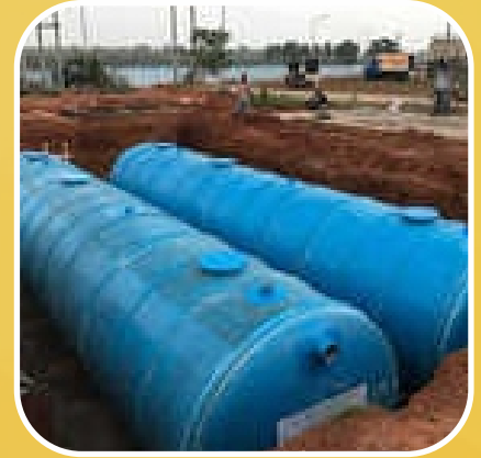
10 kld Sewage Treatment Plant