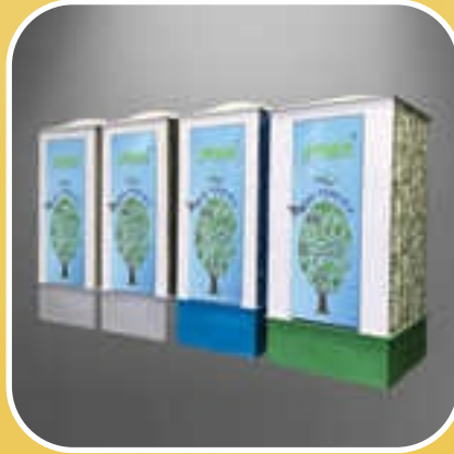
Community Bio Toilet