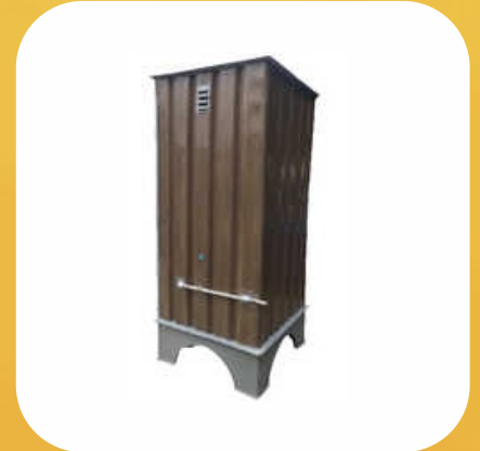
Readymade FRP Toilet Cabin