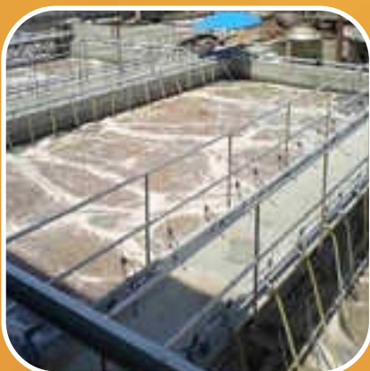
Mild Steel Manual Sewage Treatment Plant