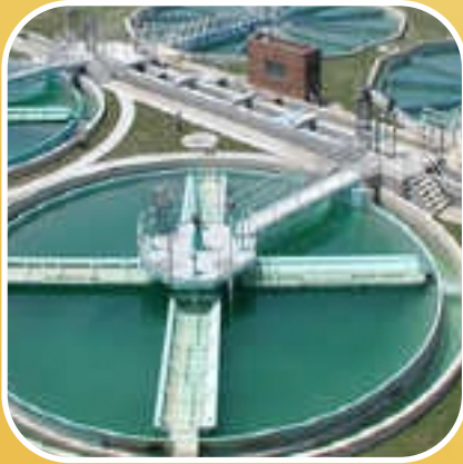
Carbon Steel Sewage Treatment Plant