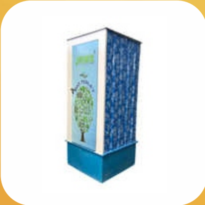
Portable Bio Toilet