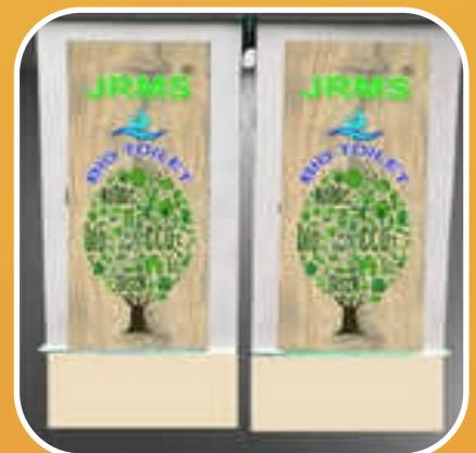
FRP Prefab Bio Toilet