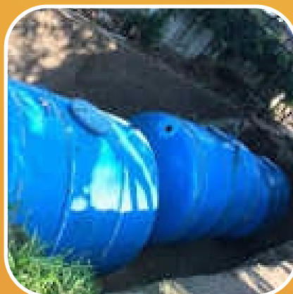
50 kld Packaged Sewage Treatment Plant