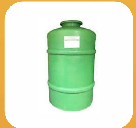
FRP Biodigester Tank