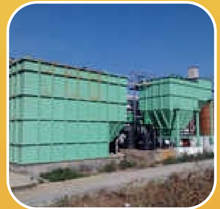
Containerized Sewage Treatment Plant